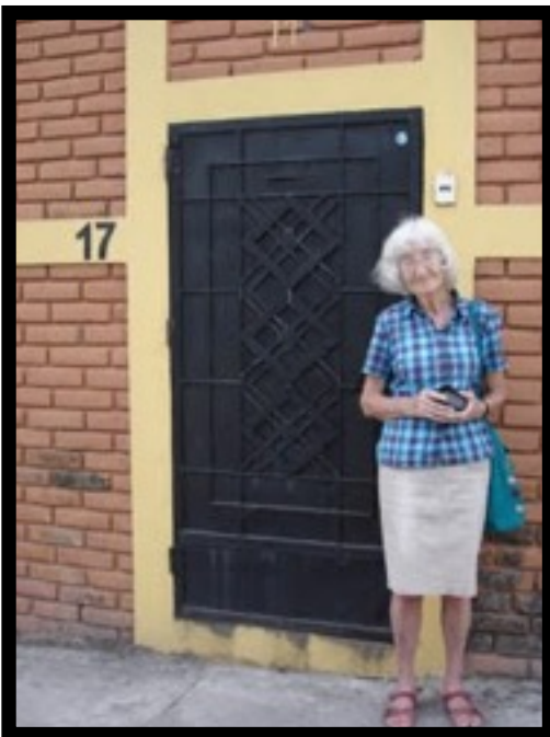
Bron outside Casa Amanda

The lunchtime conversation was mostly about deaths and violence. Megicanos, where the centre and Casa Amanda are and the staff all live there is a "Zona Rojo" (Red Zone) very dangerous. Life revolves around the tales of the latest victims. Three people who were just putting out their rubbish were killed. Yesterday twenty six people were killed apart from the usual horrific traffic accidents.